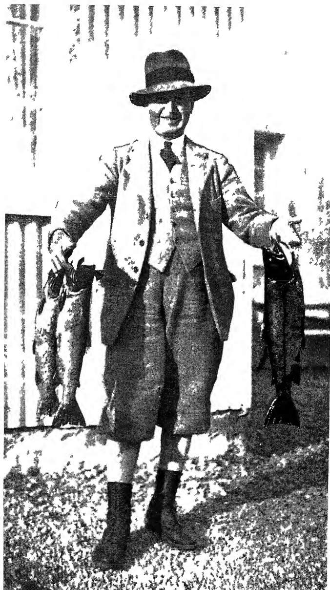
PART OF A DAY'S CATCH